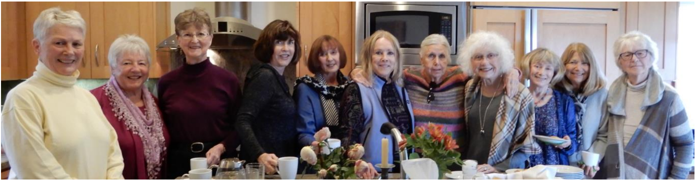
Jan 9 th , 2018