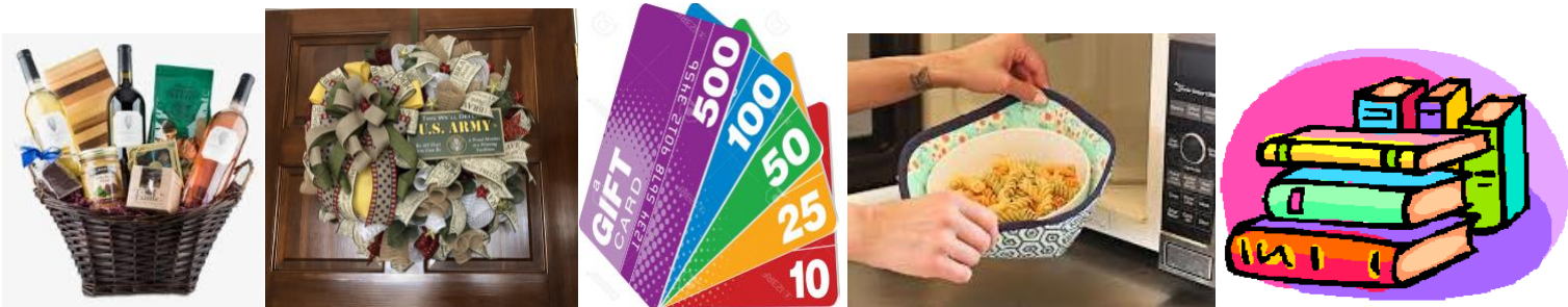
Some of Our Auction Items