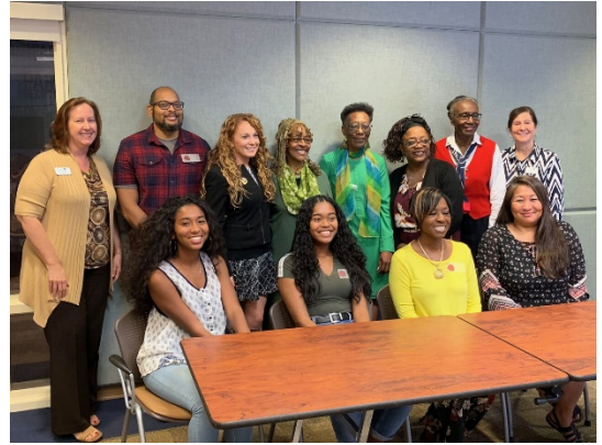
Women of the Military Panelists and Co-Presidents

Our branch activities swung into high gear with calls to action for our members throughout the fall season. Members brought their mobile phones, tablets, and laptops to the September branch meeting and logged onto the AAUW site to take the pledge to protect Title IX. Our October meeting ignited members' passion for getting out the vote and making a difference in our local and state midterm election. In November, Members donated warm scarves, gloves, and hats for local homeless veterans as part of our emphasis on taking action to make a difference in the community. Our Women of the Military program was a big hit and was featured in an article in the North County edition of the Union-Tribune on November 15.