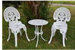
Table for Two